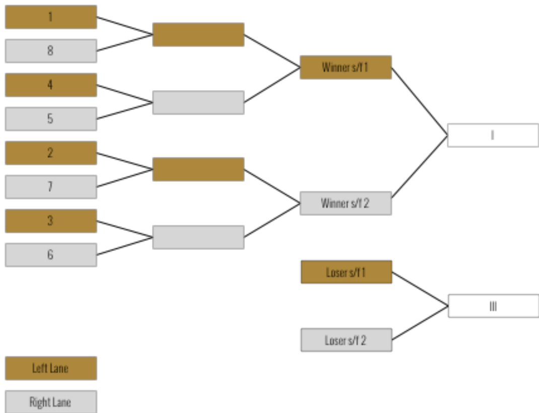
Figure 8.6(c) (Starting Order for the Final round – 16 starters)